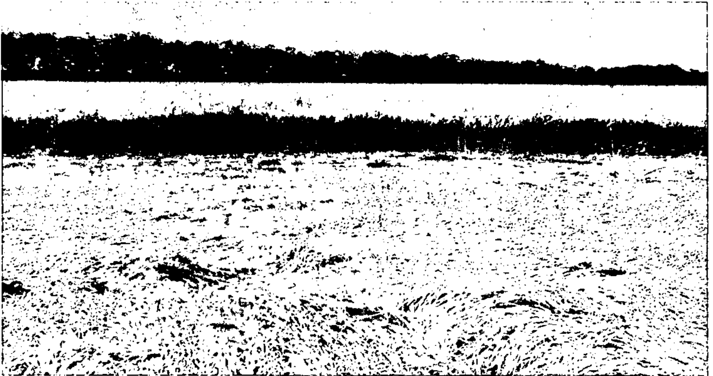
Photograph of the apparent crop circle near the city of Yeisk in the Krasnodar Region